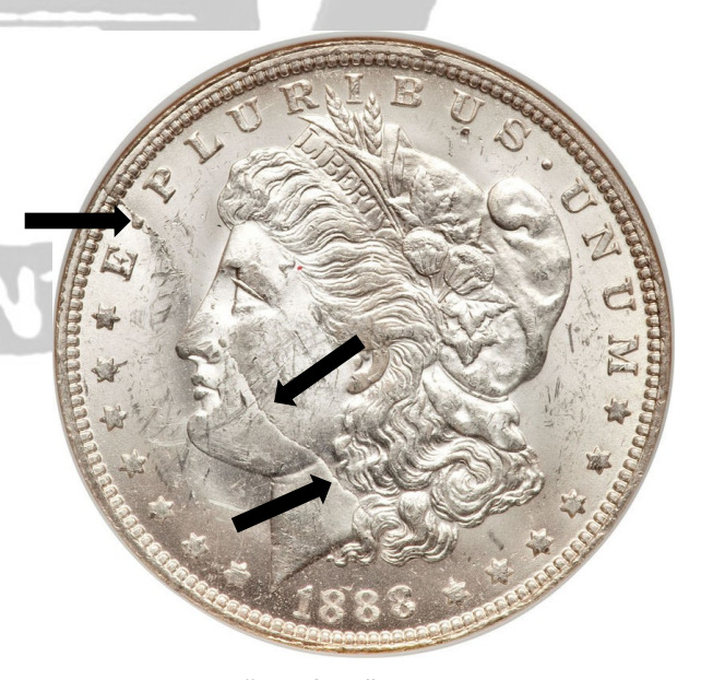
1888-O "Scarface" Variety VAM 1B